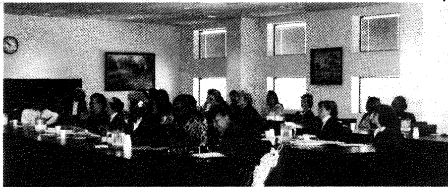
Worship, small group discussion, dialogue with NAD leaders, reports, and a business session filled the March 15-17 women's summit weekend.