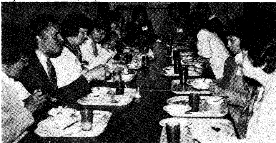
The session breaks for lunch in the CUC cafeteria.