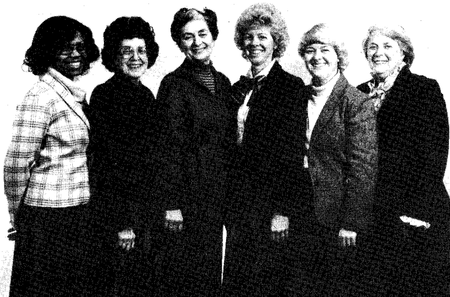
The Michianna Chapter