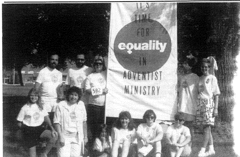
TEAM (Time for Equality in Adventist Ministry) members made a strong showing in the Fitness Event that captured much media attention in Indianapolis on Sunday, July 8. They also distributed thousands of copies of an attractive brochure that listed in four languages 10 biblical reasons to ordain women.

We also commend the Michiana Chapter for planning and carrying forward AAW's first international conference as the eighth annual meeting of the association.